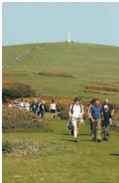
Looking back to Tennyson Monument